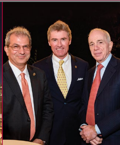
ABOVE LEFT: The Power of Stevens launched with a bang during a public kickoff on May 7.