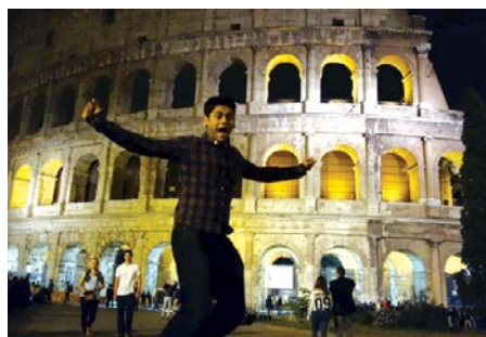
Through the OIE database, students can search almost 1,200 overseas program opportunities.

The number of students going overseas has tripled since 2013-14, when the Office of International Experiences (OIE) opened to find travel opportunities and prepare students for their trips. “The level is increasing now that