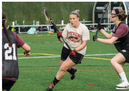
Besides varsity athletes, hundreds more Stevens students, faculty and staff use campus facilities to exercise, play club sports or take a health class.