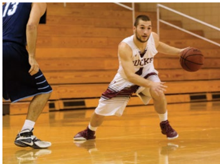
Some 650 Ducks compete on 26 teams that regularly earn average GPAs in the mid-3s.

Stevens student-athletes succeed in the classroom and at the court, mat, pool or field. In fact, because students who play sports have to balance practice, training, traveling and competing with tough classes, they often develop shrewd time management skills that propel them in their careers.