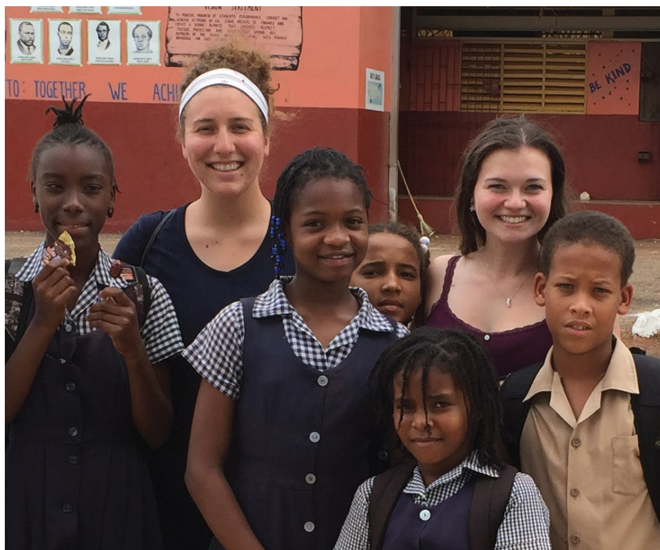
Stevens students visiting Jamaica renovated Pedro Plains Primary School near Treasure Beach and Church Hill Primary School in Negril.