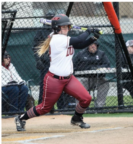
Gifts for athletics passed $520,000 in FY16, a 230% jump from the previous year.