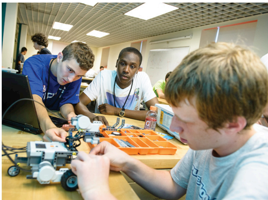
Among participants, 82% said they feel more confident in their social abilities after attending pre-college at Stevens.