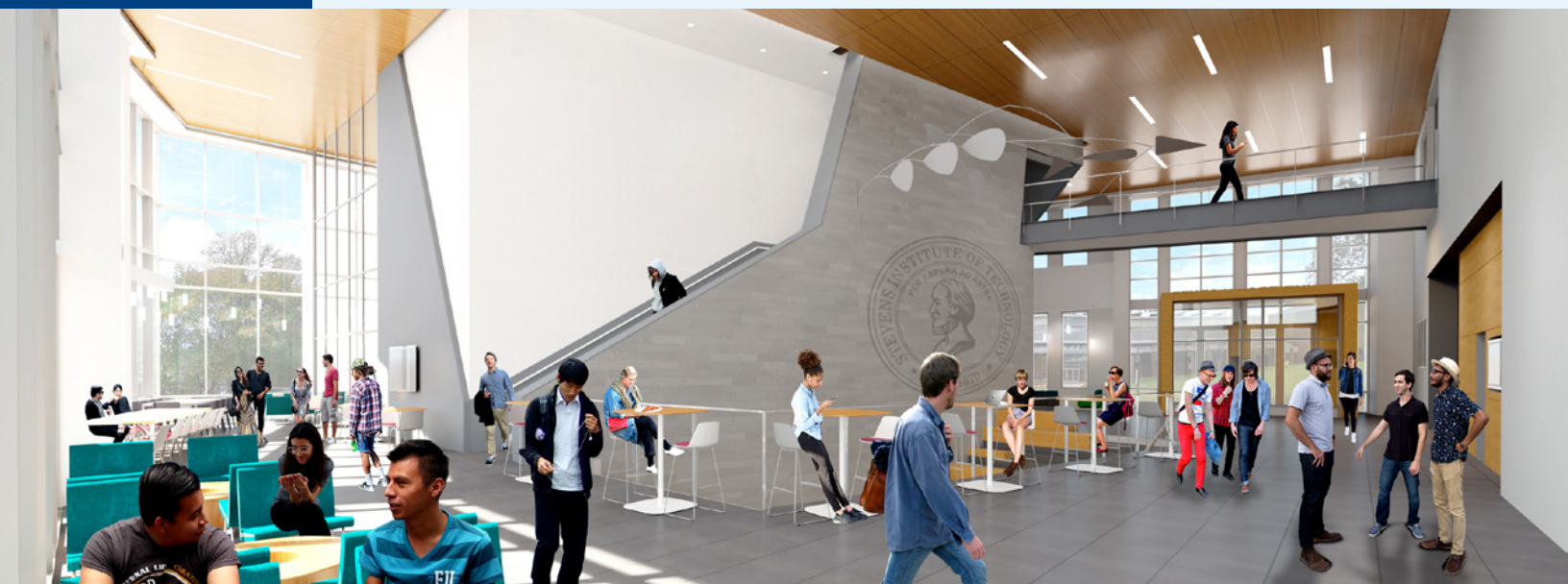
This rendering shows all the activity that will happen throughout the Gina Addeo '86 Commons East after the University Center Complex is completed next spring.