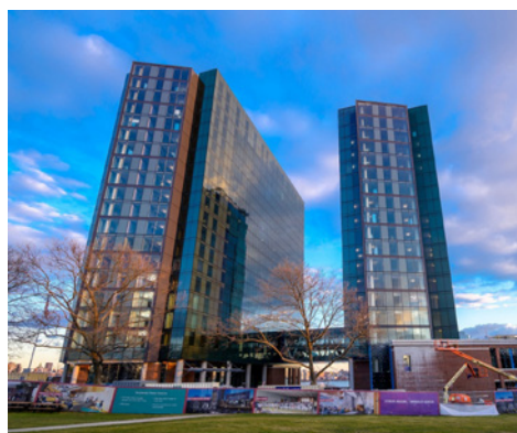
The University Center Complex is scheduled to be completed next spring.

Spaces are filling up fast in the Stevens 150 Legacy Challenge! So far, members of the classes of 1965, 1966, 1967, 1971 and 1974 have made planned gifts with matching dollars to become “Groundbreakers” supporting the University Center Complex.